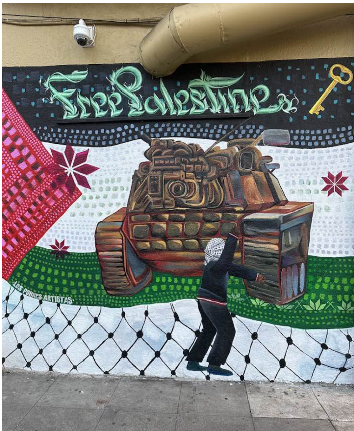
"Free Palestine" mural at the Starry Plough, Berkeley. by Los Pobres Artistas, 2023.